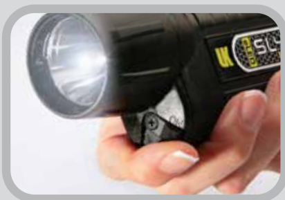
One-handed switch operation